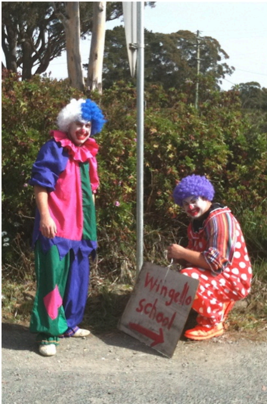
What are these clowns doing? Even clowns have to work.