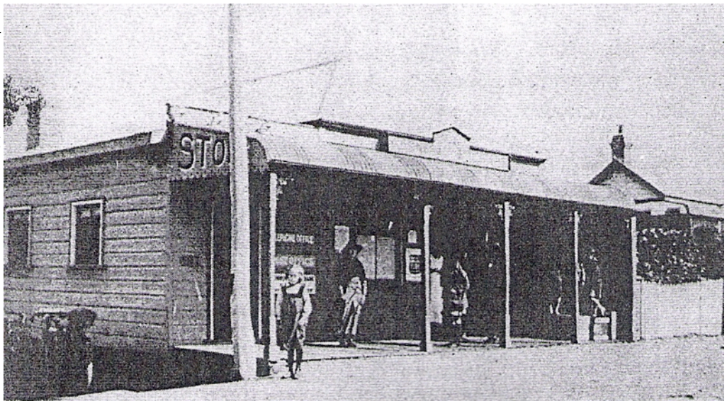
The Wingello General Store in the 1920's. Can you notice many changes?

Just looking at all the photographs and the names of all the people makes Wingello history come alive.