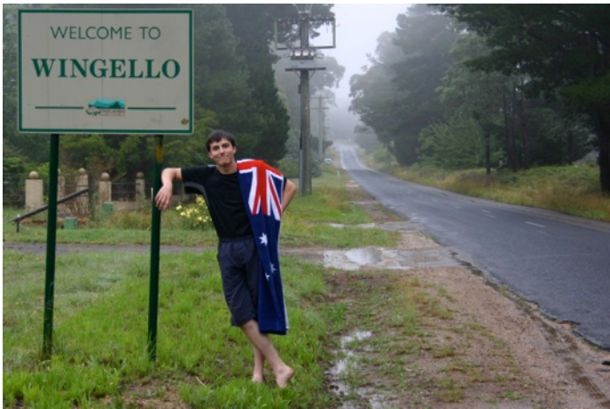
A Wingello Summer