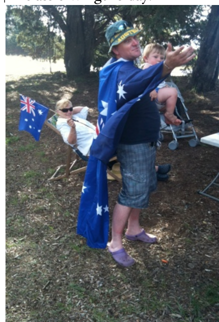
Flags flying on Australia Day