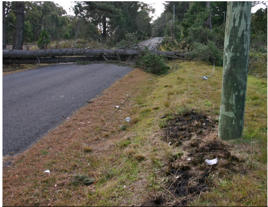
You can see the scorch marks as the lines snapped. The tree very effectively blocked all through traffic between Wingello and Penrose.

When power stops suddenly, your electrical equipment - especially computers - may be damaged. At the very least, you may lose whatever you were working on when the computer suddenly stops. The best way to protect your electronic gear is a UPS - Uninterruptible Power Supply. This not only protects from a power spike or surge, but also filters the power to acceptable limits AND provides some battery backup allowing you to safely turn off your equipment. When the lights went out on Tuesday, all of our computers at the shop remained on. The UPS's allowed us around