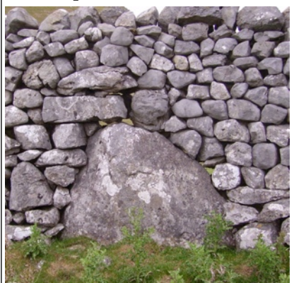
Sample Stone Wall - not a photo of what is actually being built.

Call Wayne on 0403 807 200 to book a place or more info.