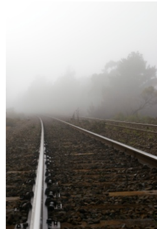
A great photo of the Wingello Train lines