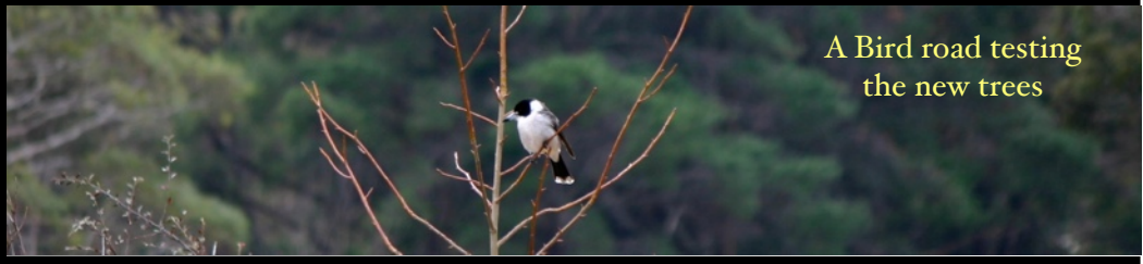
A Bird road testing the new trees