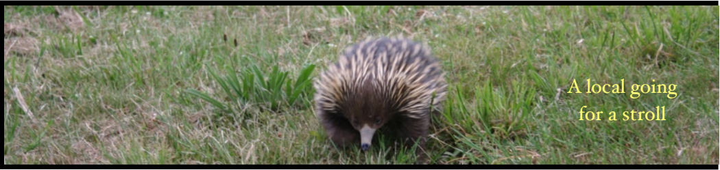
A local going for a stroll