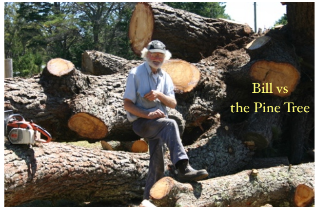
Bill vs the Pine Tree

The Village Elders - many of whom have called Wingello home for many, many years - are effectively an unofficial neighbourhood watch.