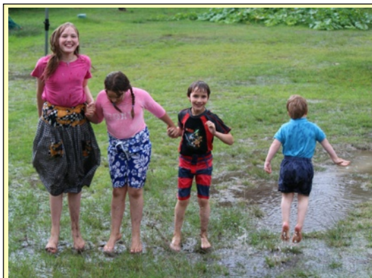
Playing in the rain