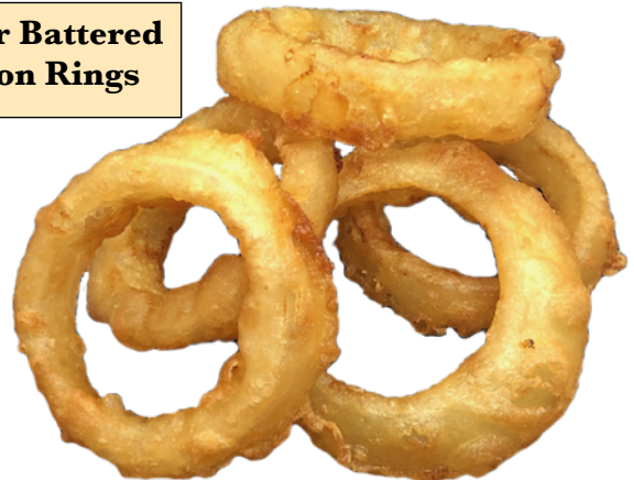
Beer Battered Onion Rings

1 x Flathead Torpedo, Medium Chips .....28.00